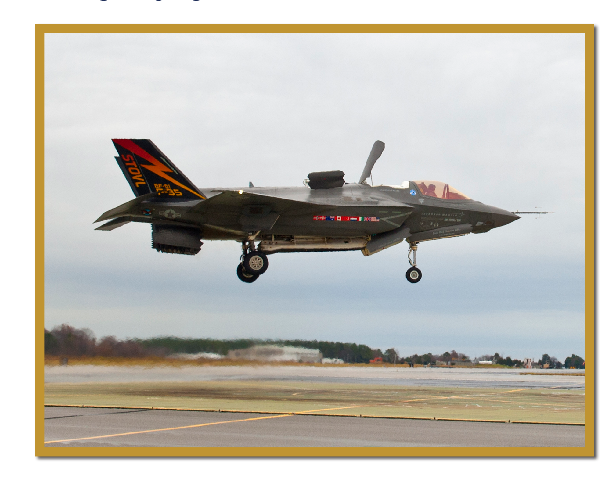
Airspace & Airfield Activities