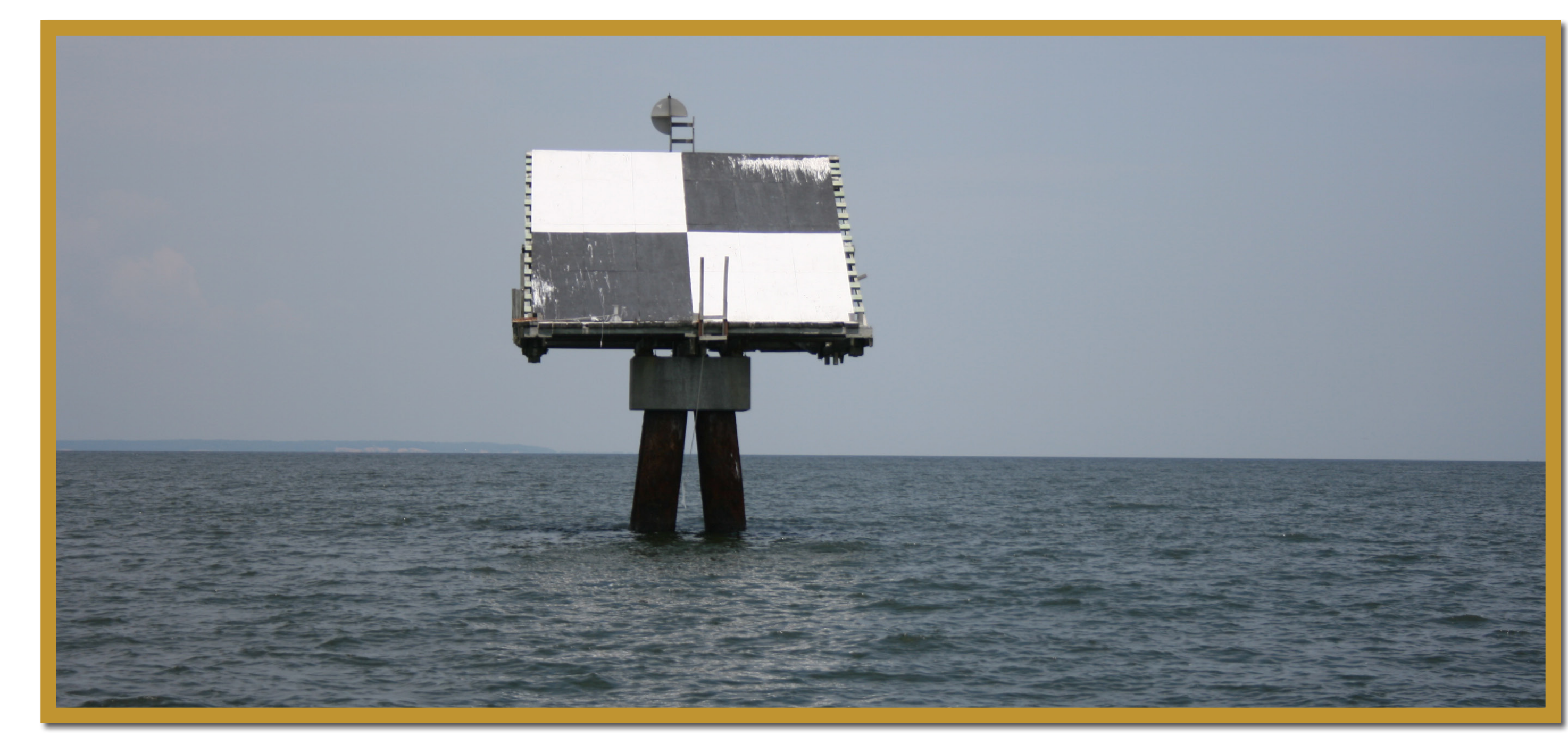
Water Resources & Sediments